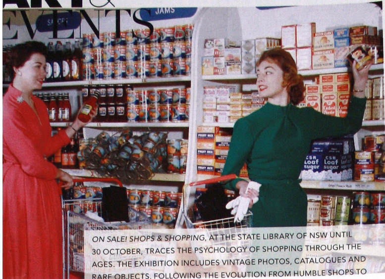
ON SALE! SHOPS & SHOPPING , AT THE STATE LIBRARY OF NSW UNTIL 30 OCTOBER, TRACES THE PSYCHOLOGY OF SHOPPING THROUGH THE AGES. THE EXHIBITION INCLUDES VINTAGE PHOTOS, CATALOGUES AND RARE OBJECTS, FOLLOWING THE EVOLUTION FROM HUMBLE SHOPS TO UPMARKET ARCADES, MALLS AND E-SHOPPING. SL.NSW.GOV.AU